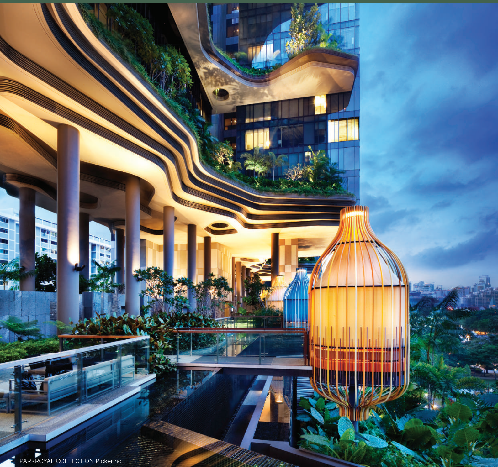
PARKROYAL COLLECTION Pickering