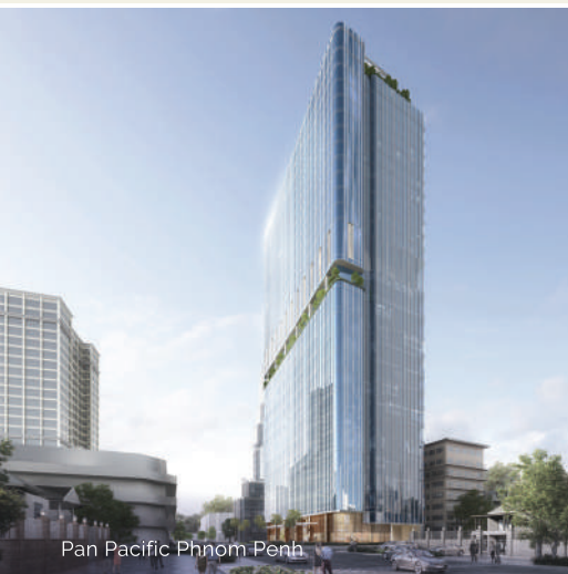
Pan Pacific Phnom Penh

Pan Pacific Jakarta is located within the same development as its sister properties, PARKROYAL Serviced Suites Jakarta and PARKROYAL Jakarta.