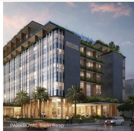
PARKROYAL Siem Reap