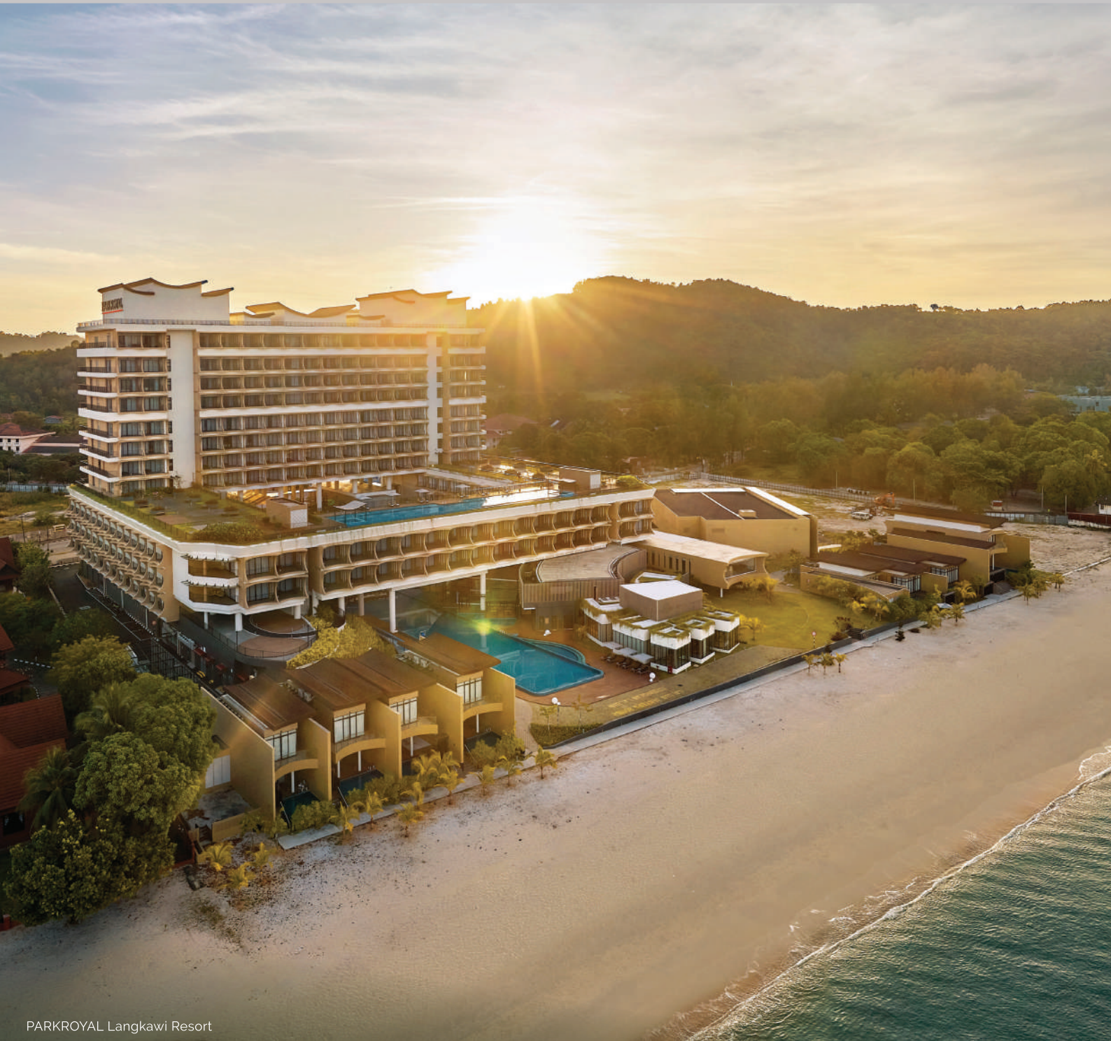
PARKROYAL Langkawi Resort